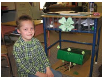
Tucker's trap is set.