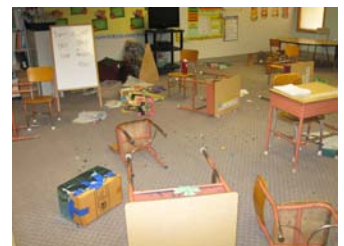
1st Grade Classroom "After" the Leprechaun's visited in the night.